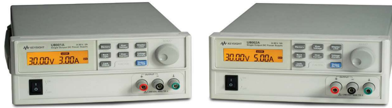
Figure 1. The U8001A 90 W and U8002A 150 W single output DC power supplies