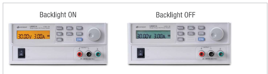
Figure 2. Backlight on/off options for LCD display