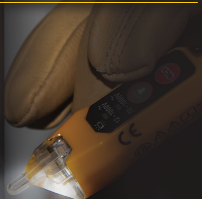
NCVT-3P Dual Range Non-Contact Voltage Tester with Flashlight