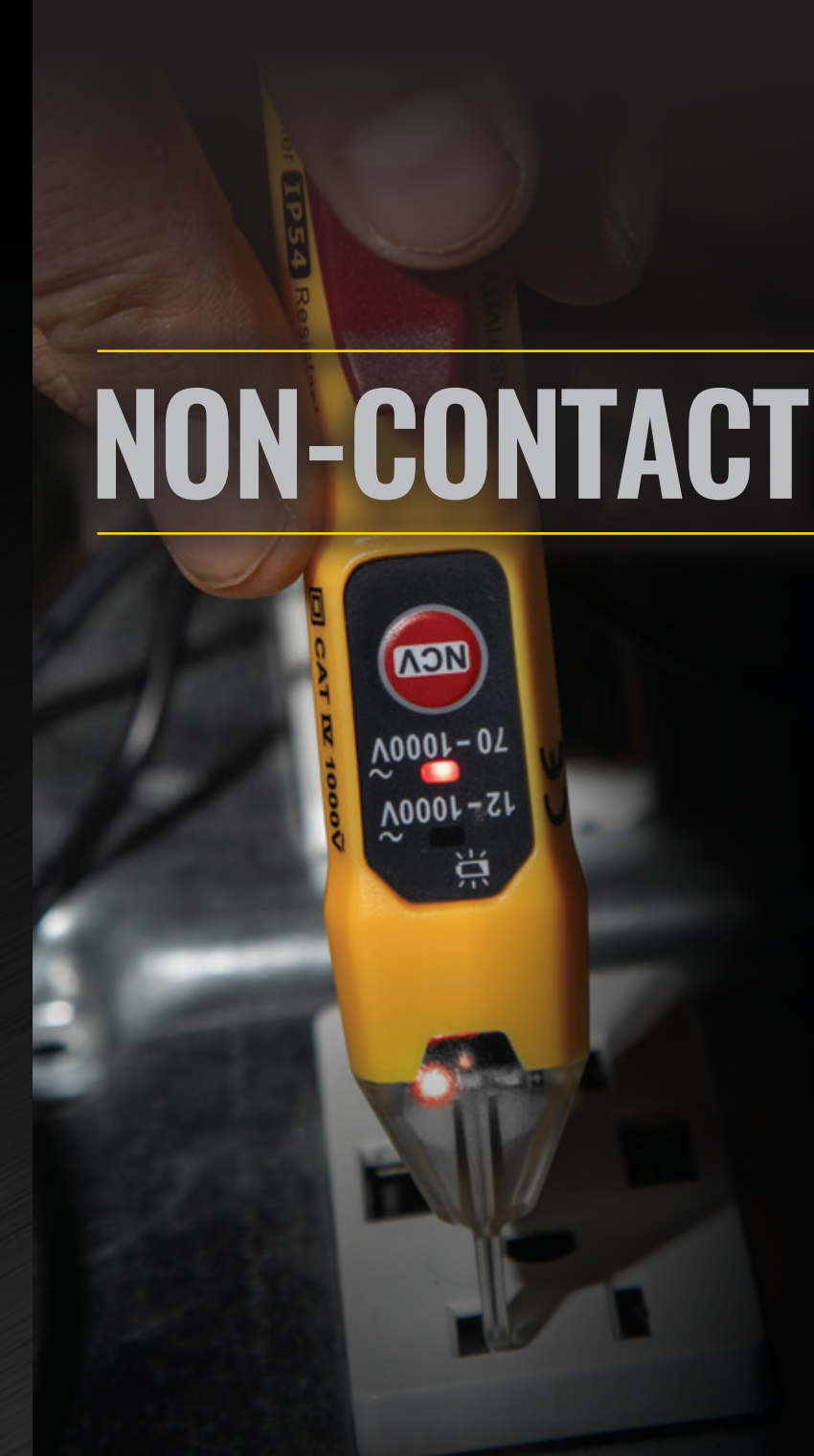
NCVT-2P Dual Range Non-Contact Voltage Tester