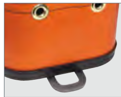
Kick Stand on back of Cat. No. 5144BHB