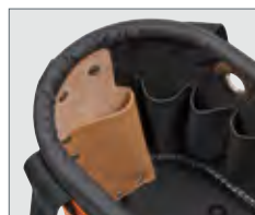
Knife Sheath inside of Cat. No. 5144HBS