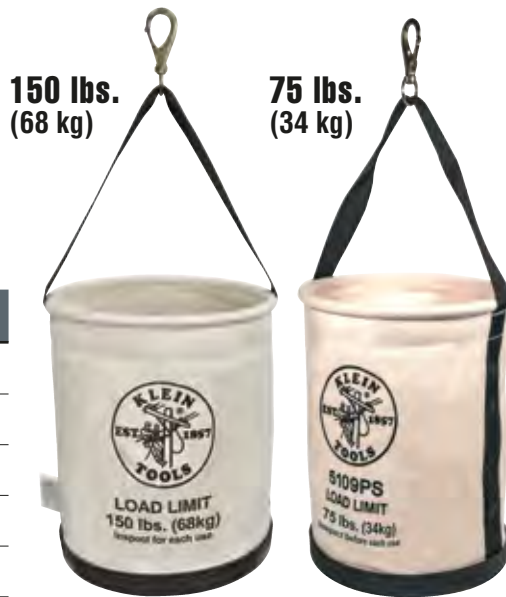
150 lbs. (68 kg)