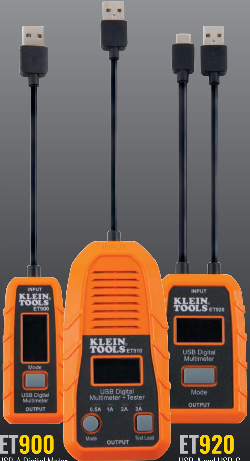
ET900 USB-A Digital Meter