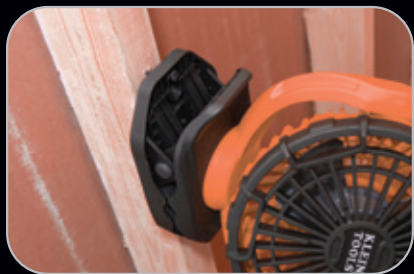
Hangs by Hole