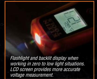
Flashlight and backlit display when working in zero to low light situations. LCD screen provides more accurate voltage measurement.