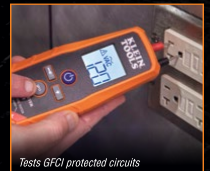
Tests GFCI protected circuits