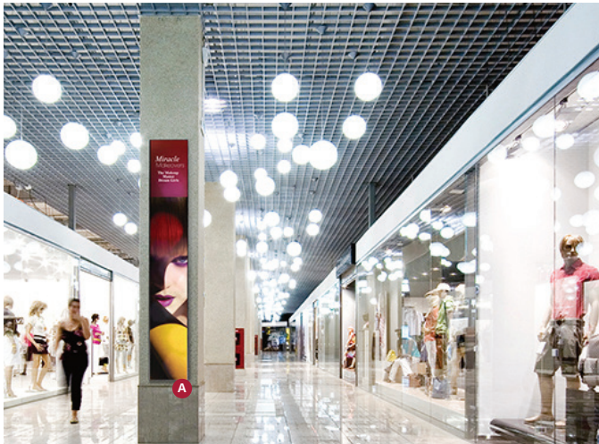
A. 86" Ultra Stretch Display - 86BH5C

LG offers that same expertise to retail stores of any size, shape and purpose. There isn't an area in a retail environment that cannot be fitted with LG display technology to create amazing customer experiences, all in the pursuit of greater retail stickiness. Just Picture It.