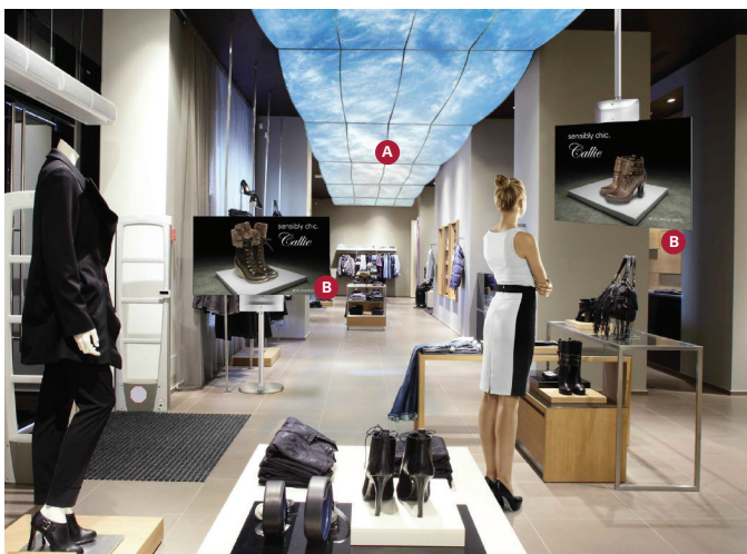
A. LG OLED Open-Frame Curved Displays - 55EF5C 55" class B. LG OLED Dual-View Flat Display - 55EH5C 55" class