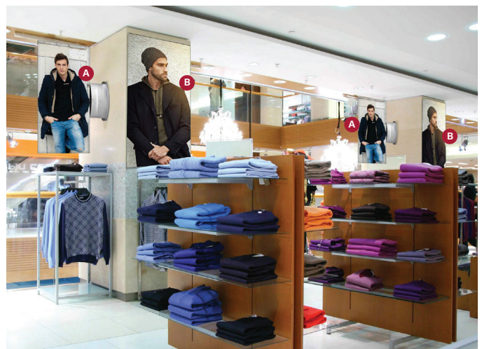
A. LG OLED Dual-View Flat Display - 55EH5C 55" class B. LG OLED Wallpaper - 55EJ5C 55" class