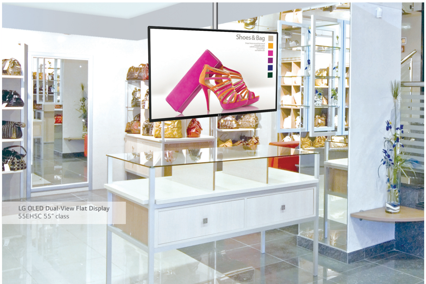
LG OLED Dual-View Flat Display 55EH5C 55" class

The same idea can be used to create endless racks and shelves. An example would be to integrate a video camera on top of a display in an eyeglass/sunglass store. A customer could then sit comfortably in front of the display, see themselves on the screen and virtually “try on” hundreds of styles with the touch of a button.