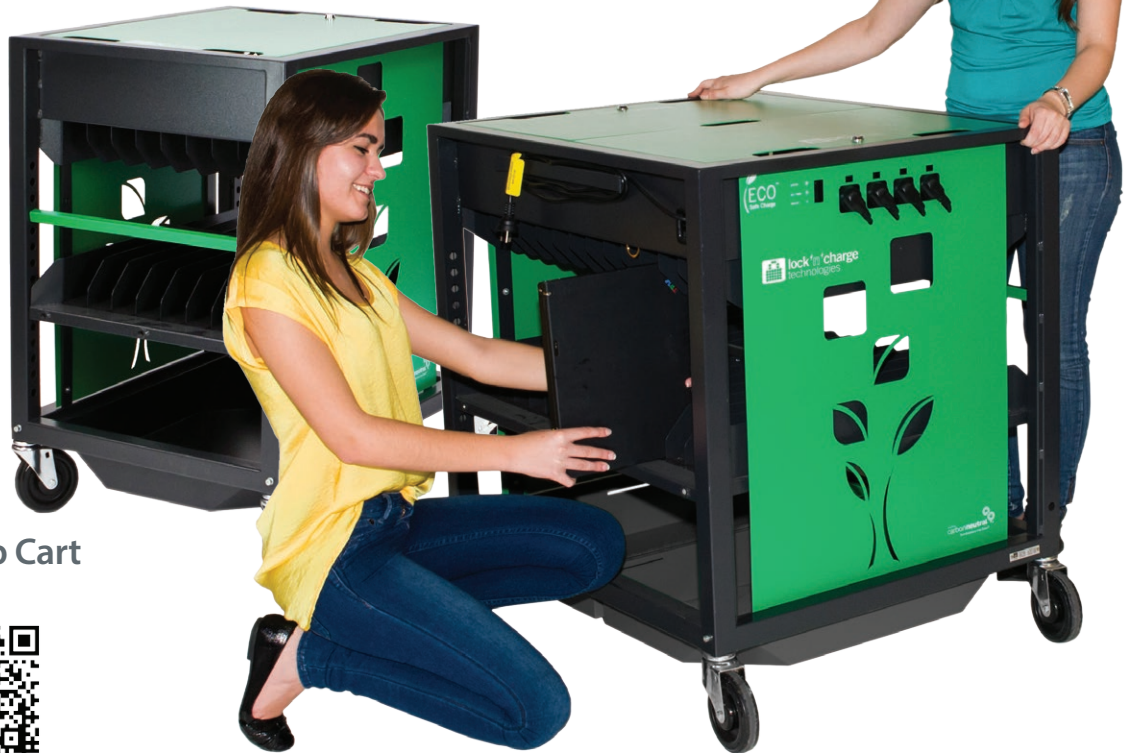
Laptop Cart 16 Bay