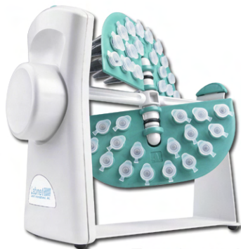
Revolver with Standard Rotisserie

With a molded housing and unique rotisserie design, the Revolver is easy to clean and decontaminate. A 36 x 1.5/2.0 ml rotisserie is supplied with the Revolver. Other configurations are available separately.