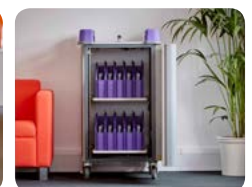
LapCabby Mini 20V