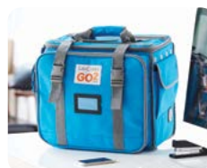
GO ® CASE