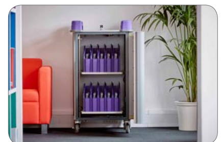
LapCabby Mini 20V