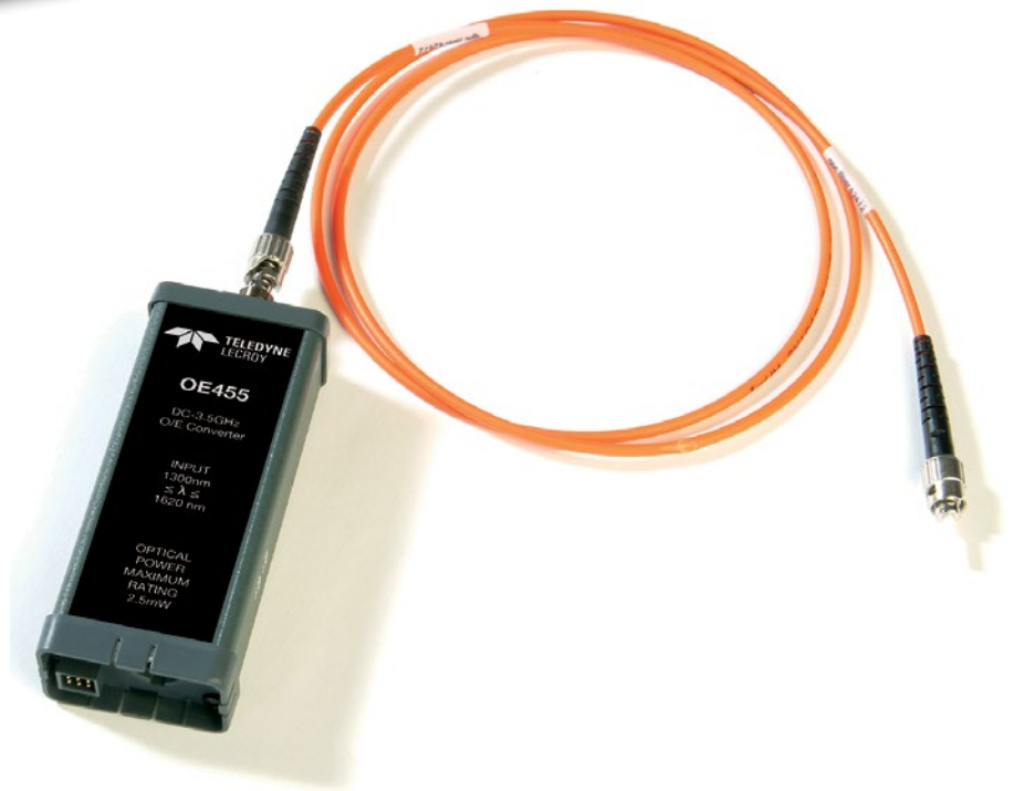
OE455 optical-to-electrical converter shown with multi-mode fiber jumper attached.

Teledyne LeCroy's wide-band multi-mode optical-to-electrical converters are designed for measuring optical communications signals. Their broad wavelength range and multi-mode input optics make these devices ideal for applications including Gigabit Ethernet and Fibre Channel, as well as SONET/SDH up to 2.5 Gb/s.