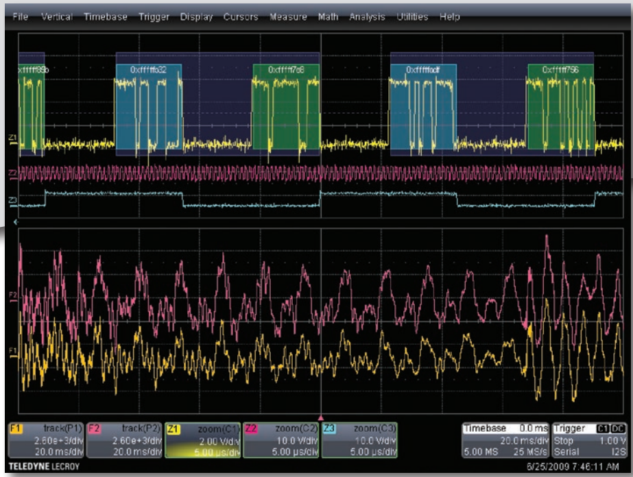
Teledyne LeCroy's unique View Audio feature converts digital audio data into analog waveforms for easy digital audio analysis and debug.

Teledyne LeCroy's serial Audiobus trigger, decode, and graph package provides all the tools needed to properly analyze and debug digital audio buses. Teledyne LeCroy's solution addresses the I 2 S, LJ, RJ, and TDM variations of the audio bus standard.