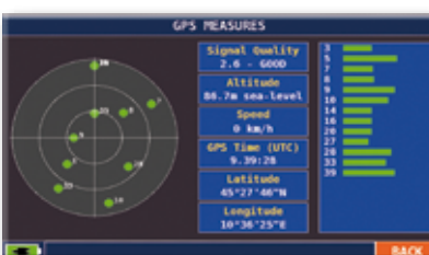
GPS antenna Quality, constellation & Position.