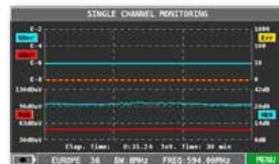
Single channel monitoring: 30 minutes