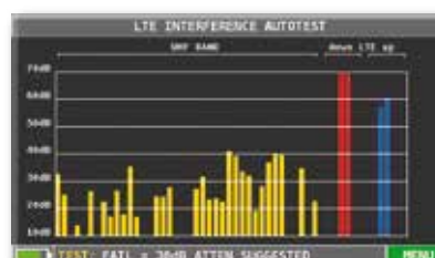
LTE Interference Autotest