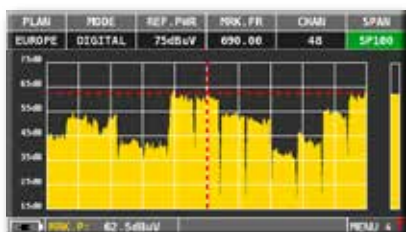
Spectrum TV 100 MHz span