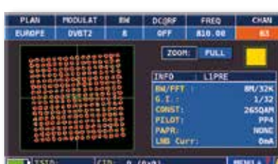
DVB-T2 (opt.) rotated Constellation 256 QAM mod., on the right relative modulation parameters & M-PLP