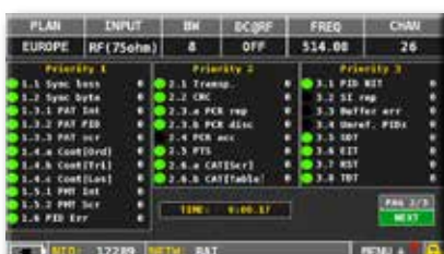
ETR 101290 Transport Stream Analyzer