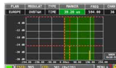
ECHO MEASUREMENT in SFN networks, with impulse response in real time, green area shows the guard interval