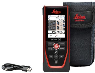
Leica DISTO™ D5 Art. No. 950908

Leica DISTO™ D5, Pouch, USB-C to USB-A Cable, Hand Loop, Quick Start Guide, Warranty card, Safety Manual, Calibration Certificate Silver