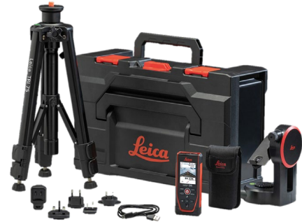
Leica DISTO™ D5 Package Art. No. 950879

Leica DISTO™ D5, Pouch, USB-C to USB-A Cable, Hand Loop, Quick Start Guide, Warranty card, Safety Manual, Calibration Certificate Silver