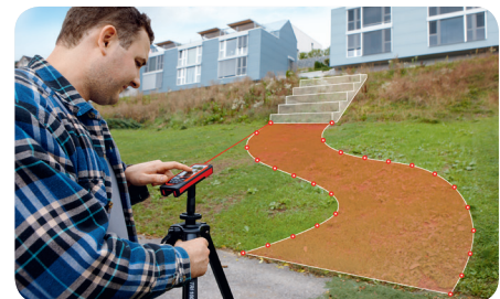
Measuring points and areas