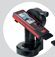
Leica FTA360-S adapter Art.No. 828 414