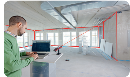
Real-time transfer of point coordinates