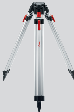
Leica TRI 200 tripod with 1/4" thread Art.No. 828 426