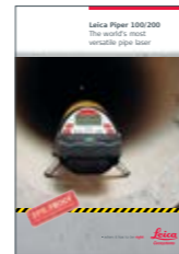
Leica Piper 100/200 Brochure