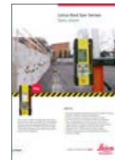
Leica Rod Eye Series Data sheet