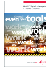
PROTECT by Leica Geosystems Brochure