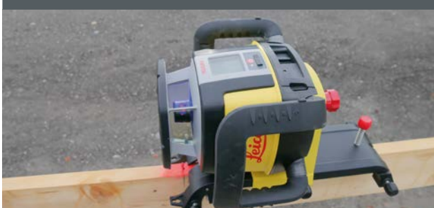
HORIZONTAL, VERTICAL & MANUAL SLOPE