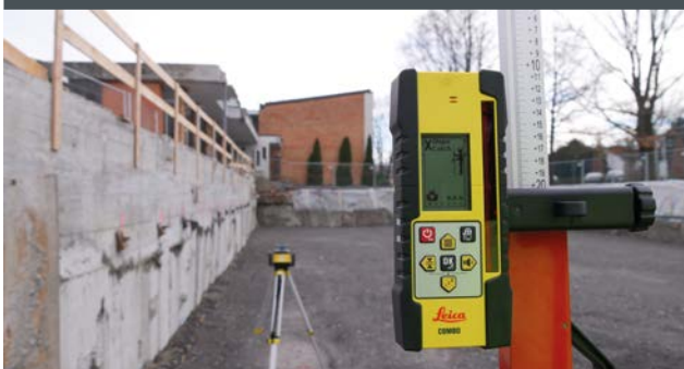
HORIZONTAL & SLOPE LASER