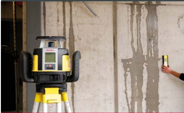
HORIZONTAL ONE-BUTTON LASER