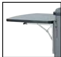
55140 ID Flip-up Shelf