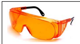
Safety Glasses 98452