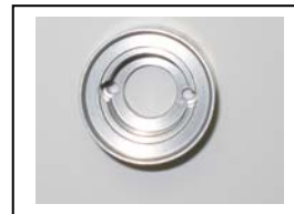
Dosimeter Adapter 1421420