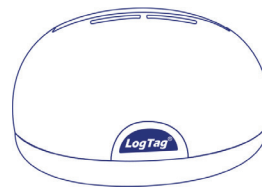
LTI HID Not Included