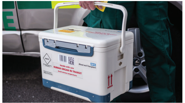
Blood & Organ Transport