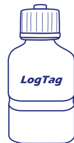
Buffer assembly Not Included (Silica sand recommended for temperatures below -40^{\circ}\text{C} )