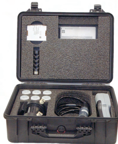
YSI 5080, ground water hard-sided carrying case with enough space for the YSI 556 MPS, a 4- or 10-meter cable, flow cell, manual, membrane kit, probe guard, batteries, and calibration solutions.