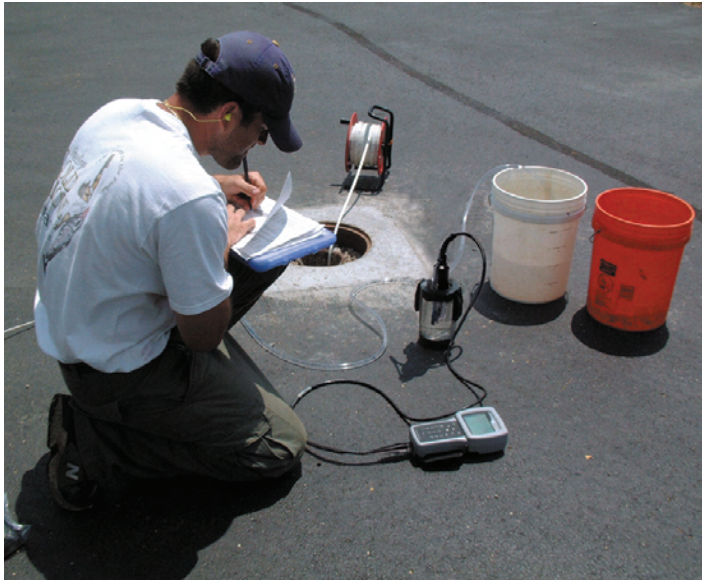
The YSI 556 multiparameter instrument simultaneously measures parameters while utilizing a flow cell to give continuous data. This method reduces the chance that changes in chemical concentrations are induced by the sampling technique.

The document also states, “It should be noted that turbidity is a very conservative parameter in terms of stabilization. Turbidity is always the last parameter to stabilize. Excessive purge times are invariably related to the establishment of too stringent turbidity stabilization criteria. It should be noted that natural turbidity levels in ground water may exceed 10 nephelometric turbidity units (NTU)” (p. 5).