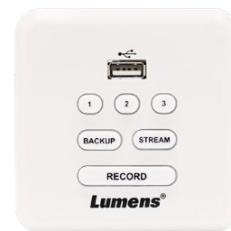
Europe standard: LC-RC01E