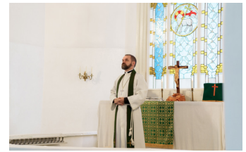
Houses of Worship