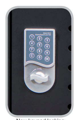
New keypad locking mechanism is an alternative to traditional keys.