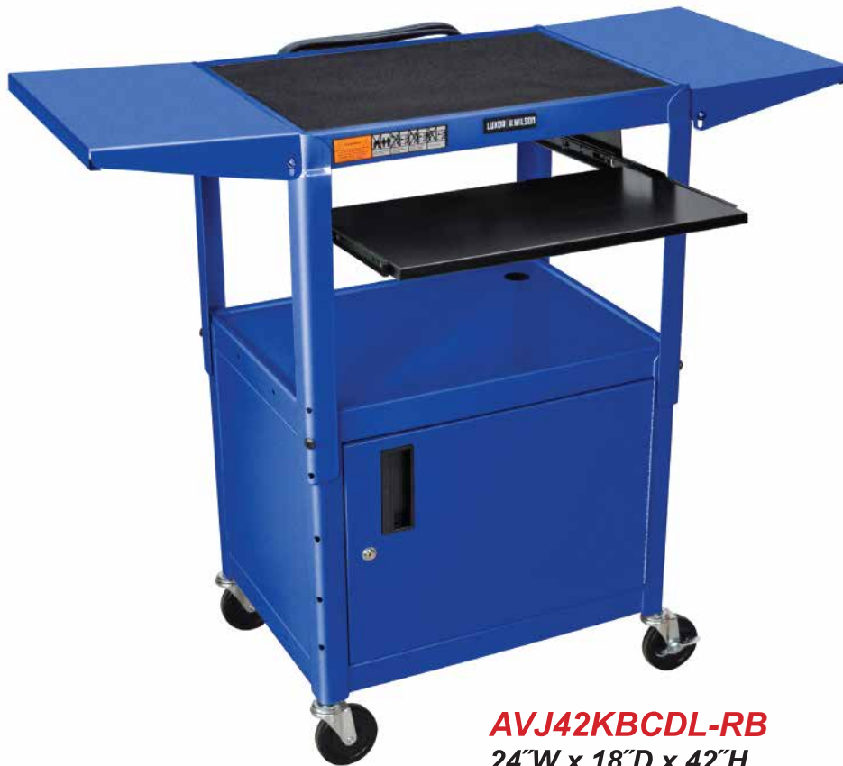
AVJ42KBCDL-RB 24"W x 18"D x 42"H