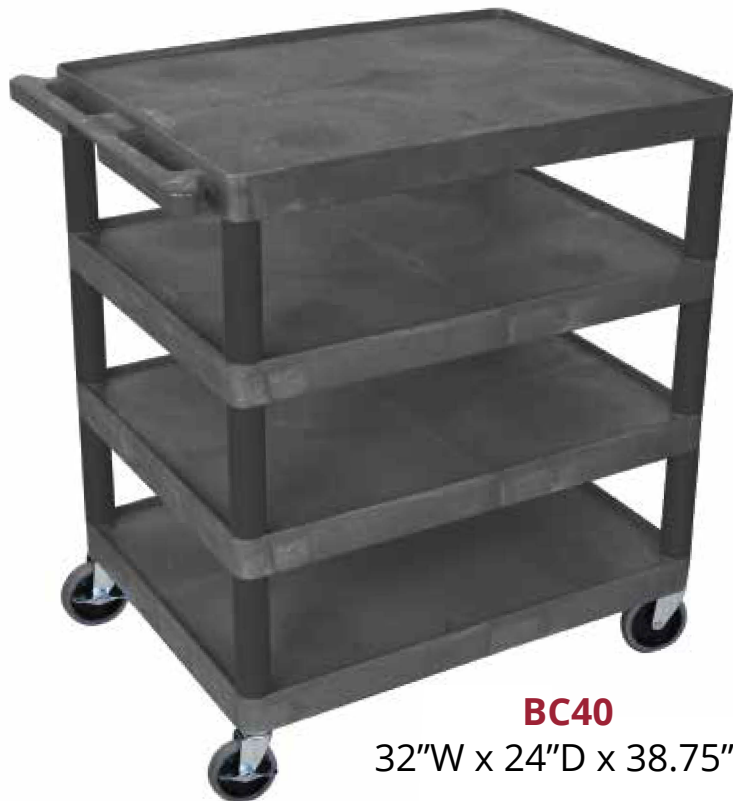
BC40 32"W x 24"D x 38.75"H