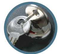
Locking lid with two keys secures tools when not in use