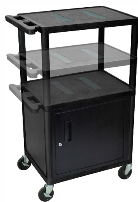
LEDUOC-B 24"W x 18"D x 34" - 42"H