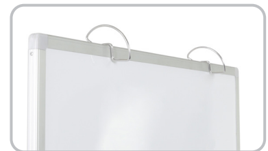
Hold easel paper pads and pocket charts

2245 Delany Road, Waukegan, IL 60087 800-323-4656 | Fax 847-244-1818 | www.LuxorFurn.com