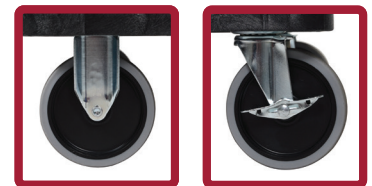
Available with 5" Heavy-duty, 5" Semi-pneumatic, 6" Semi-pneumatic casters, or 8" Fully-pneumatic casters

2245 Delany Road, Waukegan, IL 60087 800-323-4656 | Fax 847-244-1818 | www.LuxorFurn.com