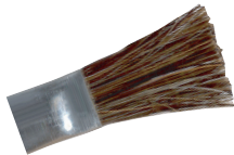
855 - HORSE HAIR CLEANING BRUSH