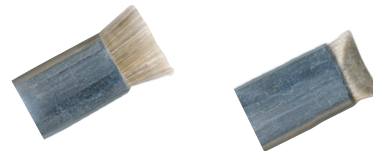
856 - DOUBLE-ENDED HORSE HAIR CLEANING BRUSH