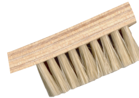
853 - LARGE HOG HAIR CLEANING BRUSH