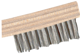
850 - STAINLESS STEEL CLEANING BRUSH