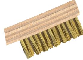
851 - BRASS CLEANING BRUSH