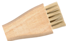
857 - CHISEL HOG HAIR CLEANING BRUSH