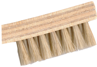
852 - HOG HAIR CLEANING BRUSH