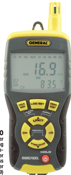
RHM700 13-Parameter Data Logging Thermo- Hygrometer with Pin/Pinless Moisture Meter (see page 9)