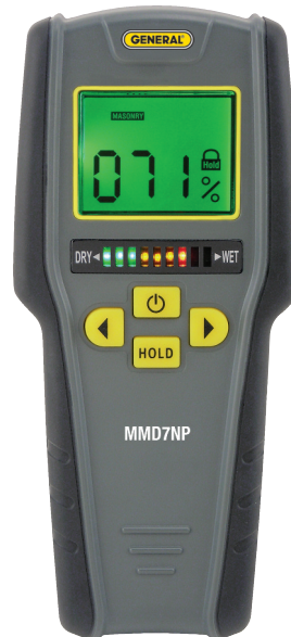
MMD7NP Pinless LCD Moisture Meter with Tricolor Bar Graph (see page 9)