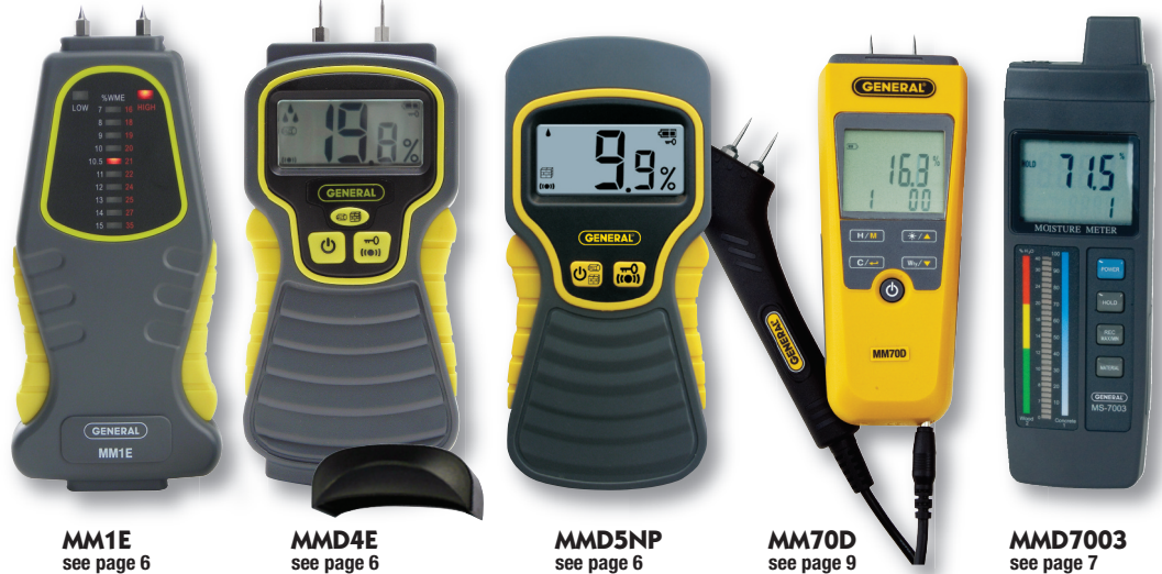
MM1E see page 6

We're especially excited about our new MMD950, with its "magic" sphere that can sense moisture 4 inches below a hard surface. This instrument and its siblings demonstrate that when it comes to construction materials like wood, concrete and wallboard, General has the right moisture measurement tool for you.