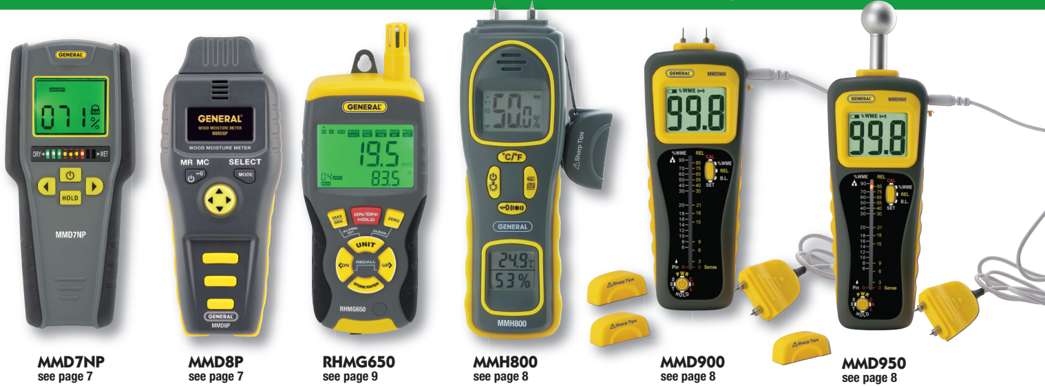
MMD7NP see page 7