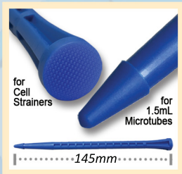
PolyPestle™ Dual-sided Pestle

The SureStrain™ Premium Cell Strainer system is a fast and easy-to-use solution for detaching, isolating and straining cells from clusters and tissues. A polypropylene frame supports a nylon mesh that is available in three color-coded porosities: 40µm (blue), 70µm (white), and 100µm (yellow). A tiered filtration process is made possible by the SureStrain's unique interlocking stackable design.