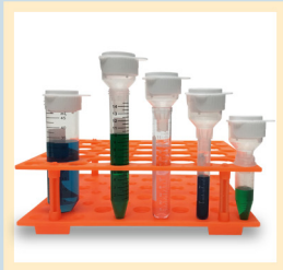
Reducing adapter for various tubes