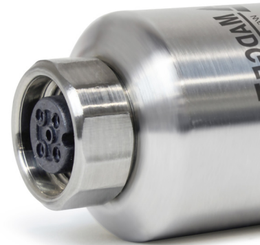
Closeup of the M12 Connector