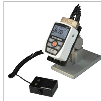
3i is shown mounted to an optional AC1008 tabletop stand with Series R03 force sensor