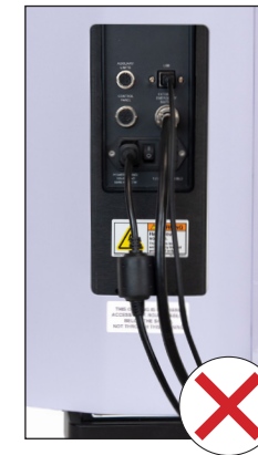
Fig. 3 Proper cable routing. Shown above: Models F105 / F305 / F505