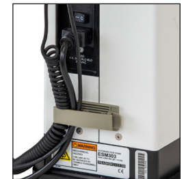
Fig. 4 Adhesive-backed guide is included for cable management