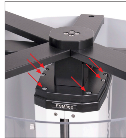
Fig. 1 Attaching the shield assembly to the top of the column

With prior firmware versions, the FollowMe® function will not operate while the door is open, however, the Auto Return function can still be used to return the crosshead to the home position automatically. Contact Mark-10 for upgrade instructions. For further instructions refer to the test frame’s user’s guide.