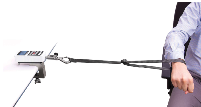
Force gauge shown in a horizontal orientation