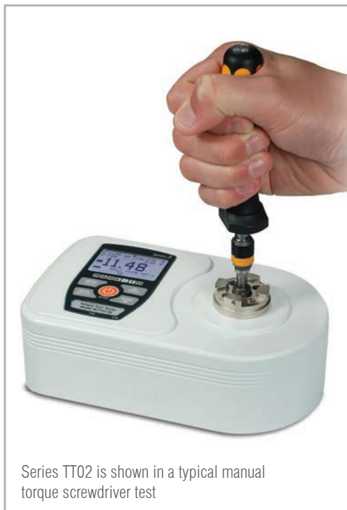
Series TT02 is shown in a typical manual torque screwdriver test

Series TT02 Torque Tool Testers present a simple and accurate solution for testing manual, electric, and pneumatic torque screwdrivers, wrenches, and other tools. These testers are compact and rugged, suitable for production environments. A universal 3/8" square receptacle accepts common bits and attachments. The TT02 captures peak torque in both measurement directions, and also calculates 1st and 2nd peaks, useful for click-type tools.