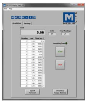
^ MESUR Lite data acquisition software is included with Series TT03 gauges

The gauges include MESUR™ Lite data acquisition software, for tabulation of continuous or individual data points. One-click export to Excel button easily allows for further data manipulation.