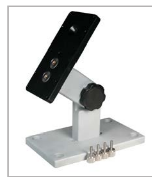
^ Optional AC1008 tabletop mounting stand