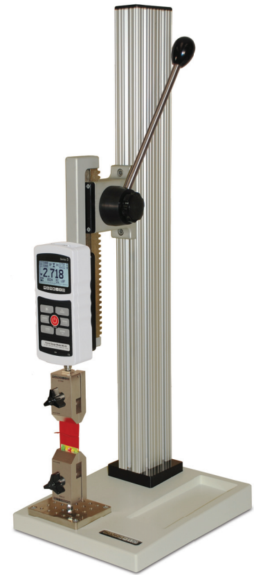
The TSB100 is shown with a Series 5 force gauge and G1008 film & paper grips