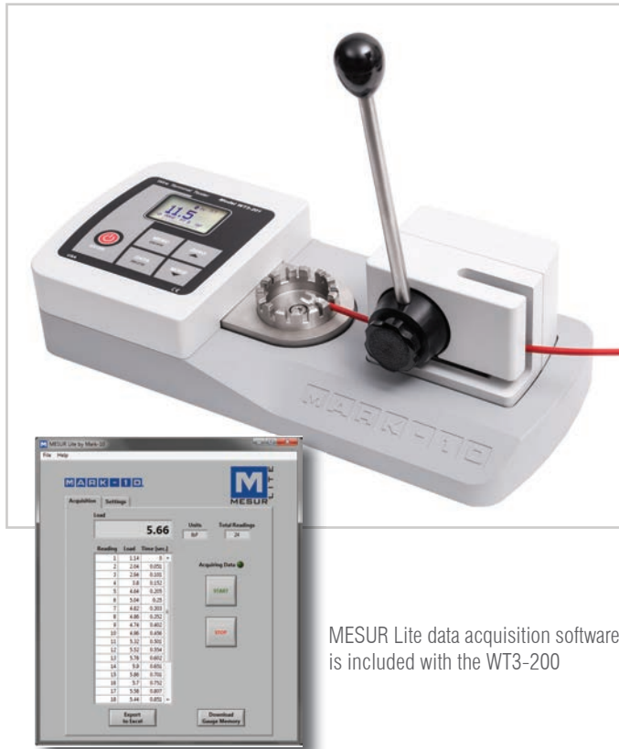
MESUR Lite data acquisition software is included with the WT3-200

The WT3-201 is designed to measure the pull-off force of wire and tube terminations. An ergonomic lever allows for easy application of up to 200 lbF (1,000 N) of force. Adjustable terminal fixture contains multiple slots for diameters up to AWG 3 (0.25 in [6.3 mm]). The tester accommodates most insulation types. Samples can be sent to Mark-10 for evaluation prior to purchase.