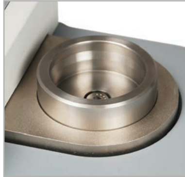
WT3003 Machinable blank terminal fixture

Secures ring terminations. Pin diameter sizes from 1/8 to 3/8 in [3.2 to 9.5 mm].