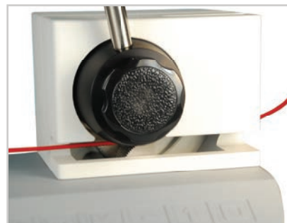
Unique knurled cam design effectively secures and pulls the loose end of the sample.