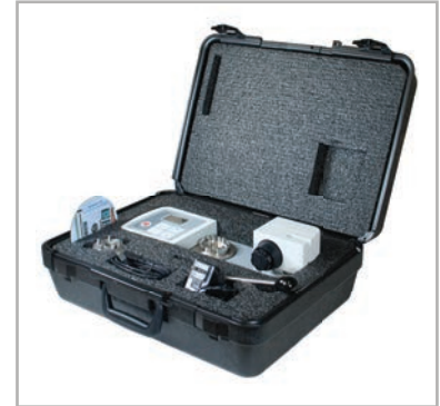
WT3004 Carrying case

Provides storage space for the WT3-201 tester, optional ring terminal fixture, AC adapter, USB cable, and accessories.