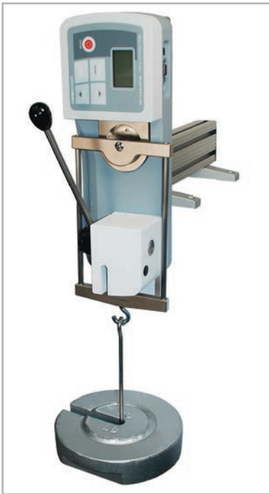
AC1049 Calibration fixture

Provides storage space for the WT3-201 tester, optional ring terminal fixture, AC adapter, USB cable, and accessories.