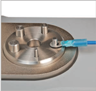
WT3002 Ring terminal fixture

Secures ring terminations. Pin diameter sizes from 1/8 to 3/8 in [3.2 to 9.5 mm].