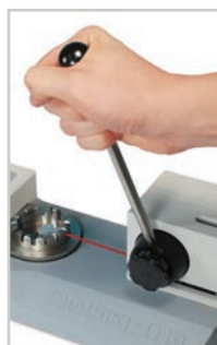
Ergonomic lever easily applies force and releases the sample.