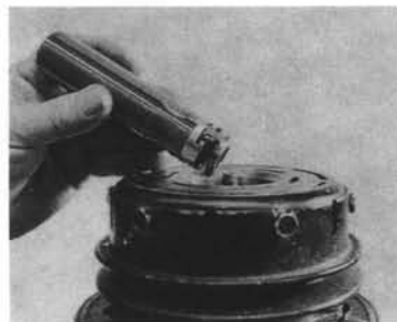
SEAL REMOVER / INSTALLER