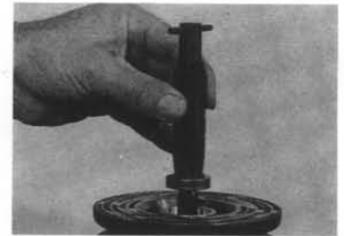
SEAL SEAT REMOVER / INSTALLER