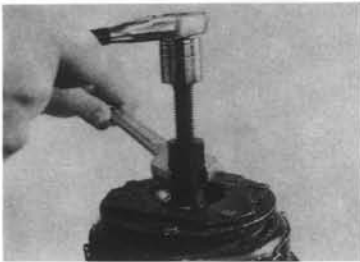
CLUTCH END PLATE REMOVER