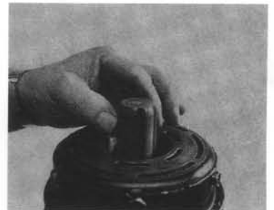
O-RING / RETAINING RING INSTALLER