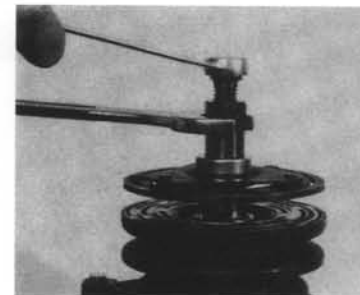
CLUTCH END PLATE INSTALLER