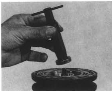
SEAL SEAT REMOVER / INSTALLER