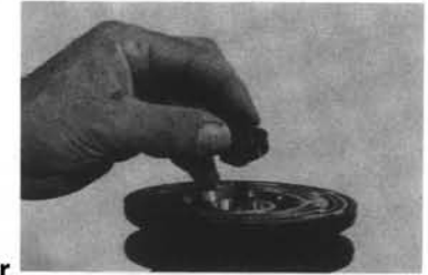
O-RING INSTALLATION GUIDE

Remove the O-ring from inside the nose cavity using the O-ring Remover .