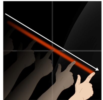
Modular design created continuous touch surface

Clarity Matrix MultiTouch features an ultra-slim profile with Planar's EasyAxis™ Mounting System. The EasyAxis Mounting System also enables fine adjustments to achieve perfect panel-to-panel alignment, creating a continuous touch surface.