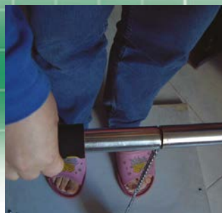
testing lumbar extension