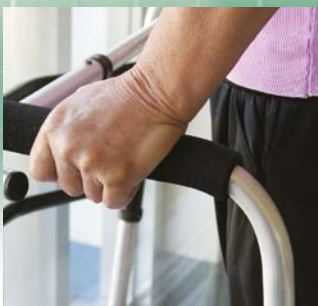
home health care