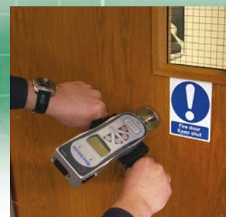
testing force to open fire door