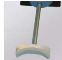
Padded Radiused Probe