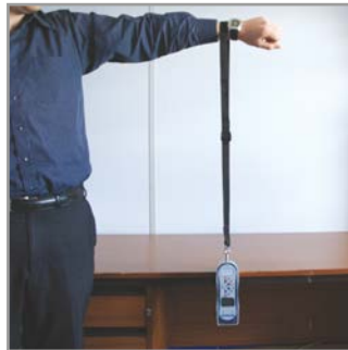
Mecmesin Advanced Manual Handling Kit testing shoulder abduction