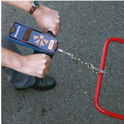
Mecmesin Basic Manual Handling Kit shown in use

It is essential to test manual handling in order to identify potential hazards that could cause harm. Equipment, which is susceptible to gradual wear or corrosion of wheels, bearings or hinges, may be regularly checked using force or torque testing instruments. This will highlight defects which can be addressed before they cause unnecessary accidents to operators or damage to products being transported.