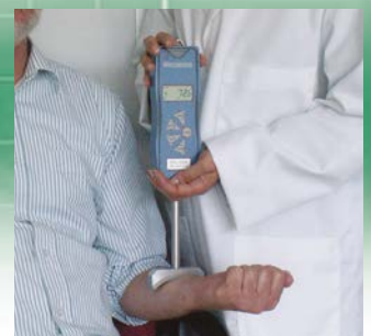
testing elbow flexion