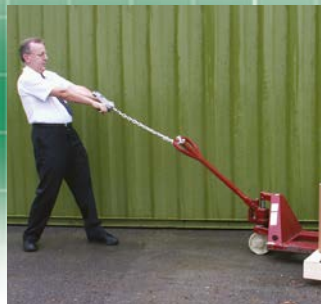
testing force to pull loaded trolley