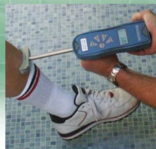
testing knee extension