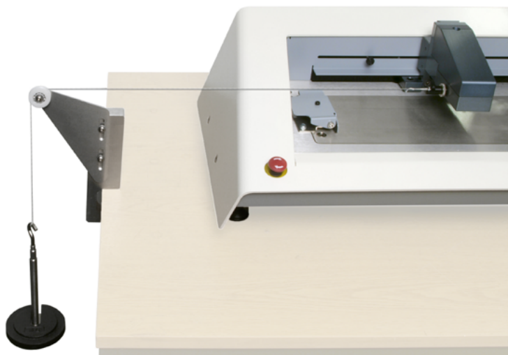
432-635 Pulley jig clamped to bench-top and calibrated weights applied for loadcell accuracy verification