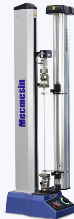
▲ MLTE 1200 mounted on MultiTest-dV 0.5 kN