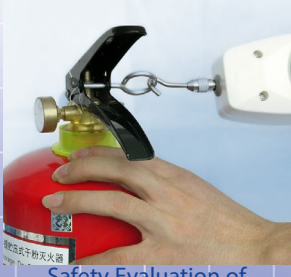
Wire Pull-out Test