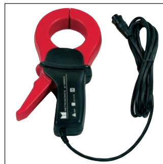
Current Clamp CP1000WCE