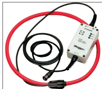
Rain Tight Current Probe CP-600/6000RT CP-300/3000RT CP-100/1000RT CP-6000B7