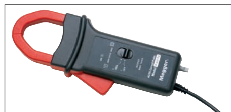
Current Clamp CP-600DC