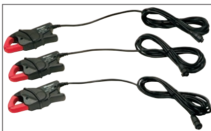
Current Clamps CP-5CE CP-20CE CP-100CE