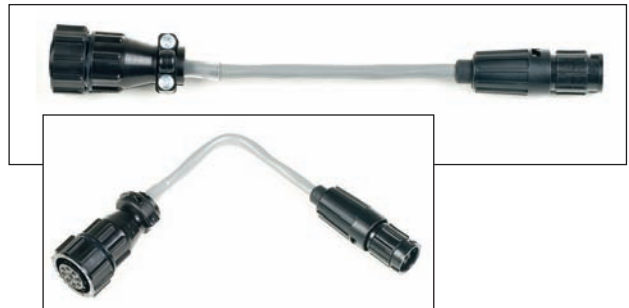
Adapter C/N CA-PA9-7, shown, is used with a probe with the PA7, SLM-8, RVA4 and RA Recorders. Used with the following CTs: