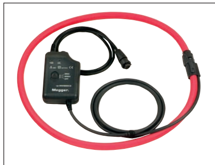
Current Probe CP-600/6000CE CP-300/3000CE CP-100/1000CE